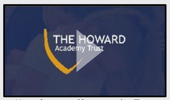
Hear from staff across the Trust