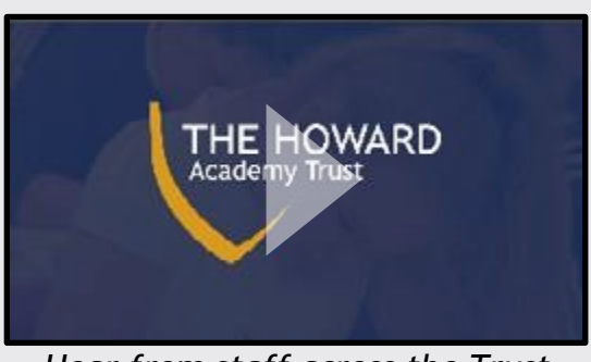
Hear from staff across the Trust