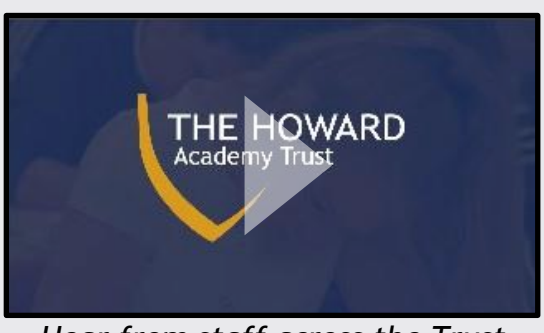
Hear from staff across the Trust