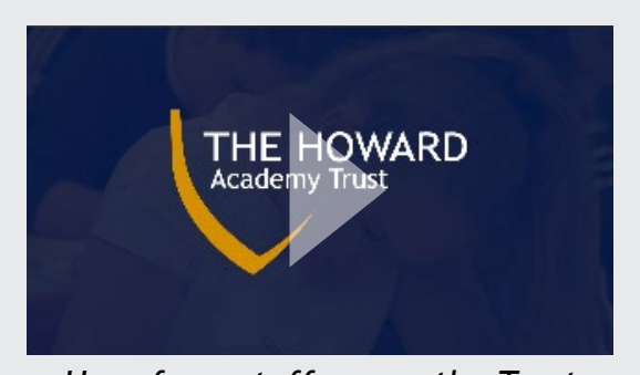
Hear from staff across the Trust